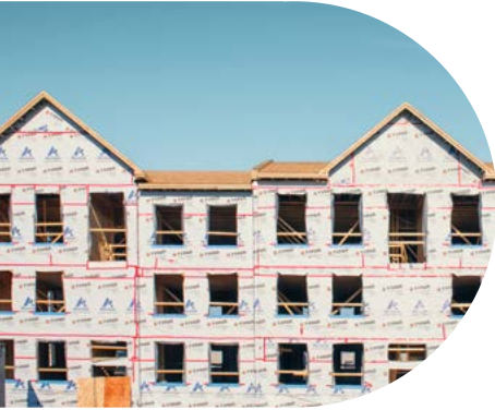
Description and objective